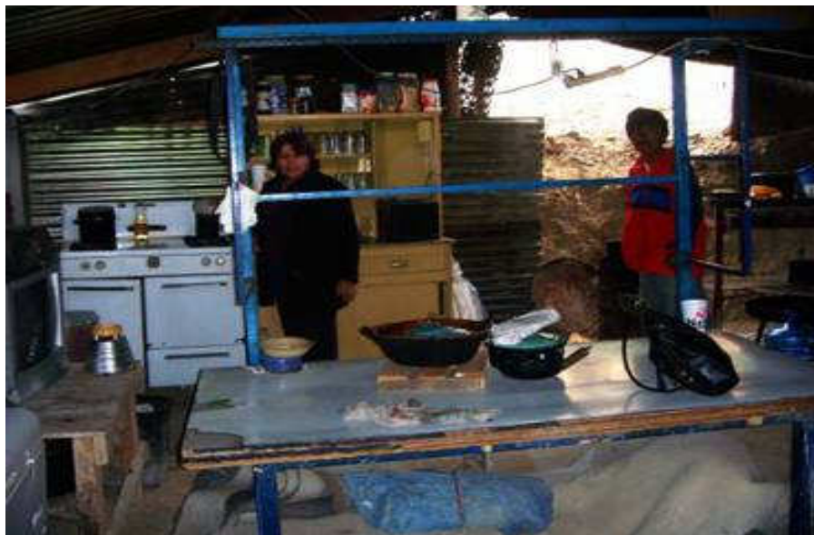
Kitchen at "The Towers" outside Salinas, Nuevo in Mexico

Wednesday, April 9, 2008 www.hazlehurstmethodist.org