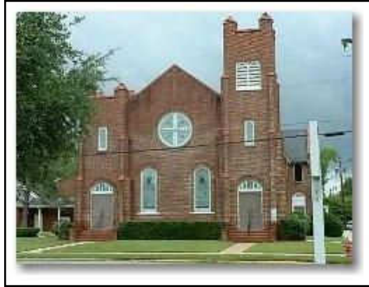
Charge Conference 2008

I must admit that it's not very often that I have considered Charge Conference as a moment worth getting exciting about – particularly not worthy enough to place on the front of our Newsletter. If you couple this with the fact that this will be our 2 nd Conference of this year and 4 th in the last two years, it may sound even more confusing. But great things have been happening and this years Conference which will be held on October 7 th will be another edition.